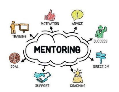
Priority 2: Providing Reading Support and Intervention at English Martyrs Catholic School and Sixth Form College

We are delighted to announce the launch of our Key Stage 4 & 5 Reading Support Mentor Programme! We have secured the support of twenty of our older students who have given their time before and after the school day to help our younger readers. Our mentors will each support a specially selected group of students with their reading in the Learning Resource Centre.